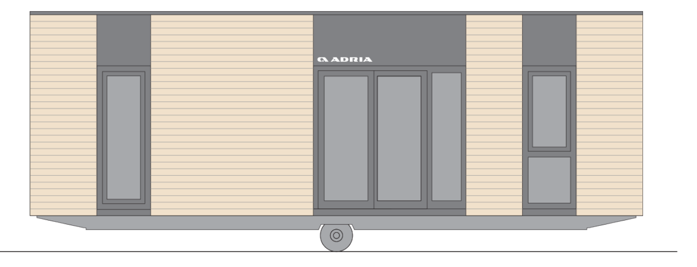
MLine 905 C32